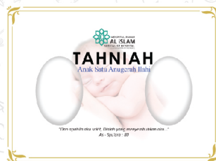
Footprint & Certificate