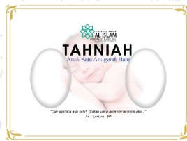
Footprint & Certificate